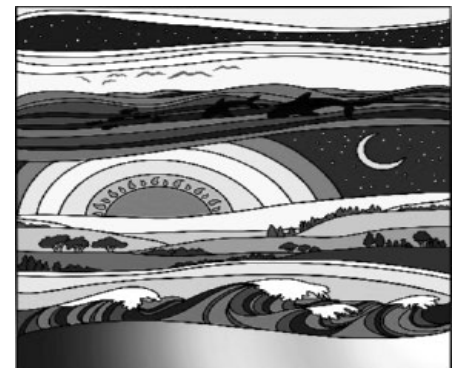
Caring for God's Creation