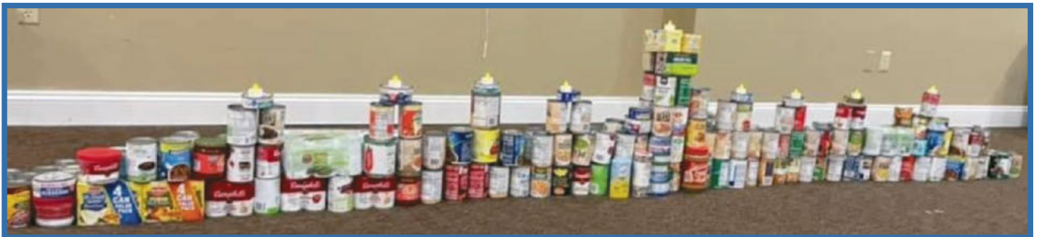
Our Religious School students made a Hanukkiyah out of the cans that were then donated to the Mitzvah Food Program!

As you can see there are SO many fun and exciting things happening in the Religious School. As the Spring continues I'll be sharing really interesting, inspiring and unique programs and events we are adding to next year's Religious School experience.