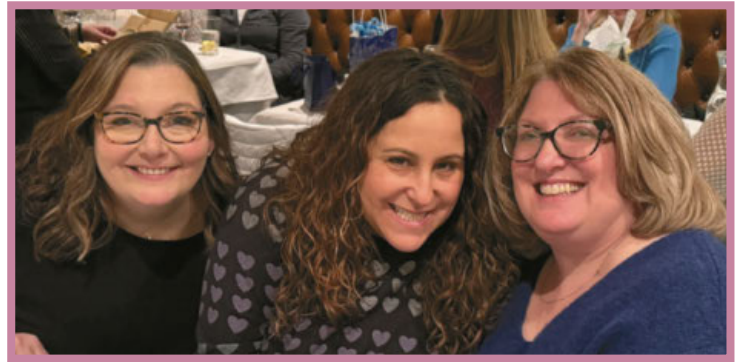
Sisterhood Chanukah Celebration at Viggiano's

The Sisterhood board thanks everyone for the amazing participation that we have had so far, and we are excited to see what 2024 brings!