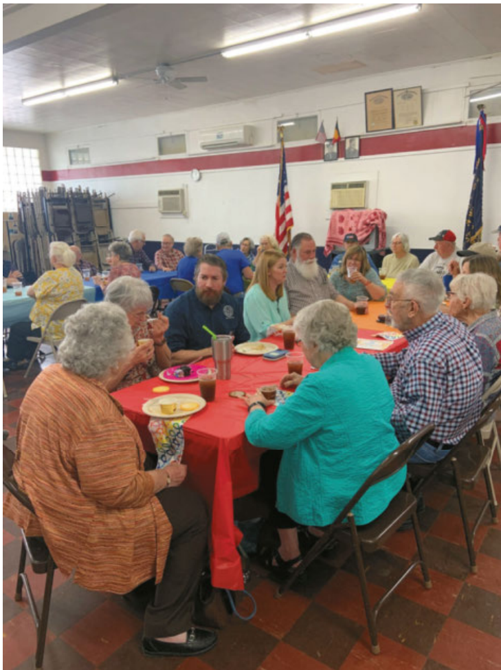
Members enjoying our April birthday and anniversary luncheon.