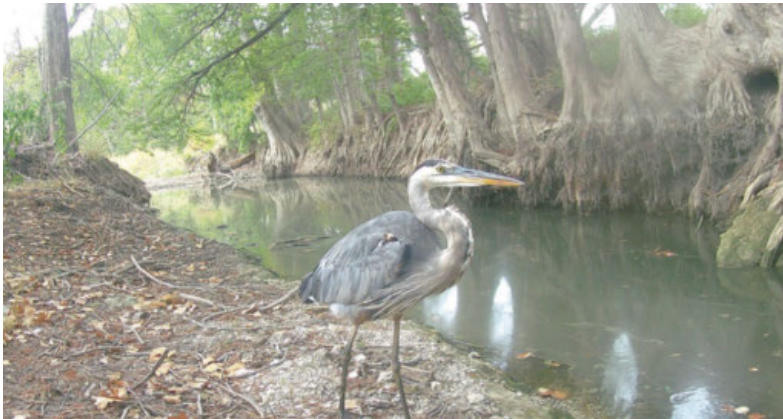
Crane in Cypress Creek, 2023.

Our hope is that these magnificent Winter Texans will always be welcome. We hope you will do your part to make this happen.