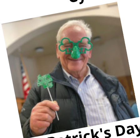
St. Patrick's Day