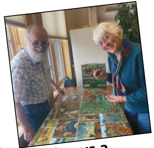
Always a puzzle going