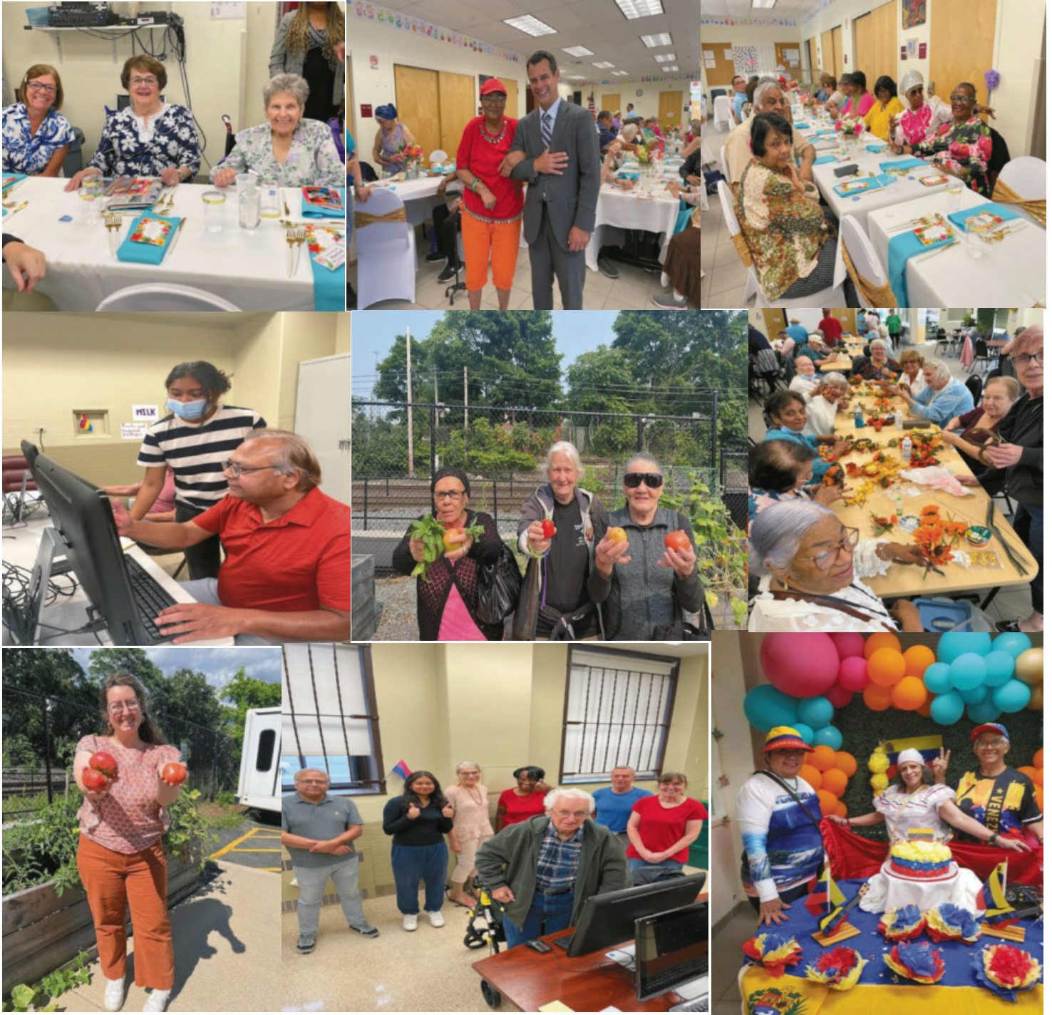
Summer Highlights 2024

Due to construction in our building, we will temporarily not have access to our kitchen. Please be assured that we will continue to provide breakfast and lunch. Breakfast will consist of coffee and a variety of other items such as fruit, muffins, toast and yogurt. Not all breakfast items will be availability daily but we will do our best to ensure that seniors have a breakfast. In addition, generally we will be serving hot lunches during this period of time.