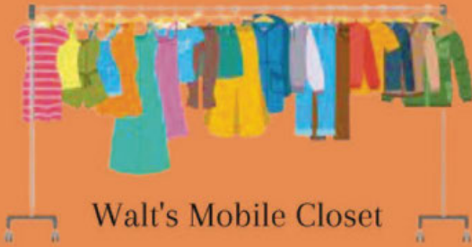
Walt's Mobile Closet