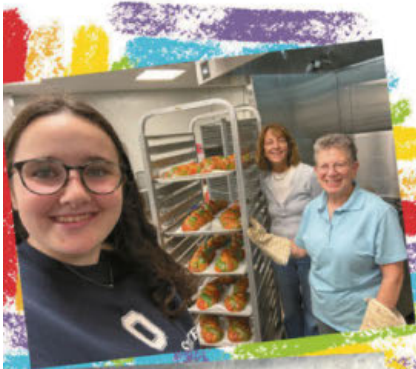
Members of our congregation made rainbow Challah to celebrate Pride month & raise money for P24.