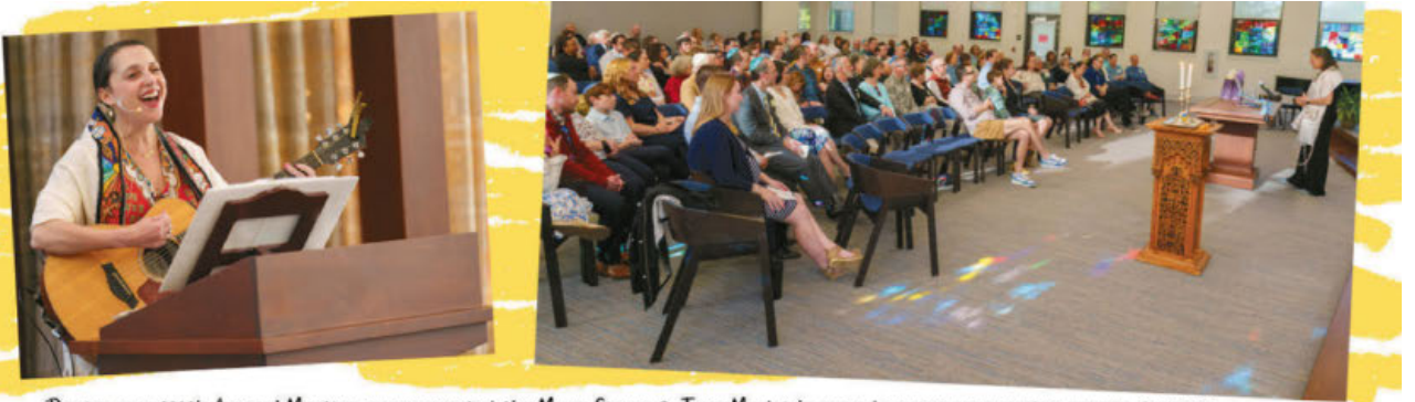
During our 179th Annual Meeting we presented the Marc Simon & Teen Madrich awards, gave an overview of our finances, talked about upcoming board changes & gave security updates