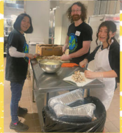
Tikkunapalooza 2025: over 200 of our congregants come out to volunteer during our annual mitzvah day event