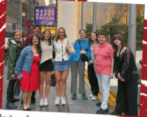
In April, our Confirmation students took a trip to New York City to learn about the Jewish immigrant experience