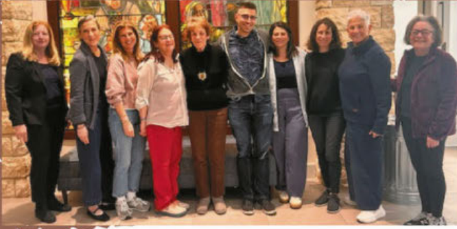
Students from Rabbi Mars' class on the book of Proverbs marked the last day of class with a group photo.