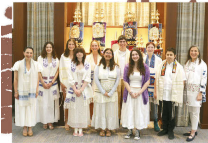
Congratulations to our 2025 Confirmation Class!