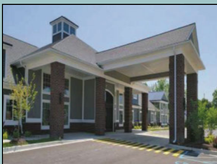
Studio, One & Two-Bedroom Apartments with Private Patios Available!

Make an appointment with our MMAP Counselors if you believe you qualify for this program by calling (810) 744-0960.