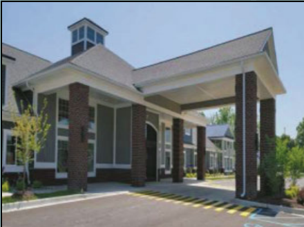
Studio, One & Two-Bedroom Apartments with Private Patios Available!