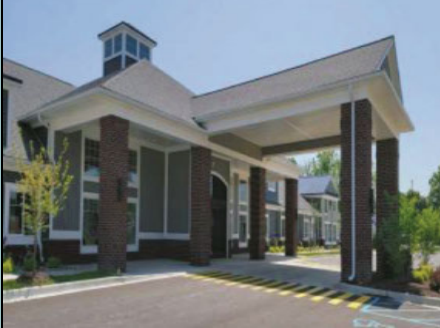
Studio, One & Two-Bedroom Apartments with Private Patios Available!